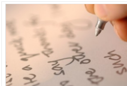
A mother writes a painful letter to her son outlining what she can and can no longer do in the face of her son's alcoholism.